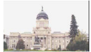
The Montana Capitol building in Helena just celebrated its 100th birthday.

The remedy will involve removing all but the side walls of the stairs and rebuilding the support structure. A waterproof membrane will be installed to prevent water seepage, and the landing will be sloped to allow water to run off, O'Connell said. |